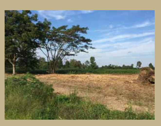
Fertile lush pastures, rich wooded forests!

Or visit our website at www.auctionsunited.com