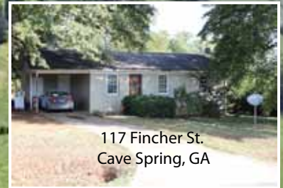
117 Fincher St. Cave Spring, GA

Build your dream home or turn it into an RV Park. All necessary permits have been granted. Property line extends to middle of Big Cedar Creek!