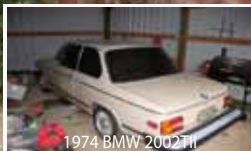
1974 BMW 2002Ti