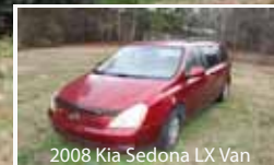
2008 Kia Sedona LX Van

Real Estate Terms: A 10% Buyers Premium will be added to the highest bid and will be paid the day of the sale. The balance is due on or before closing within 30 days.