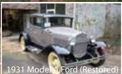
1931 Model A Ford (Restored)