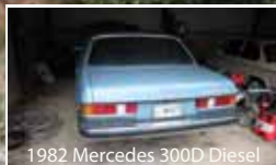
1982 Mercedes 300D Diesel