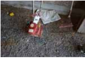
25. Mantis Tiller