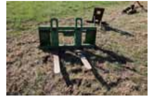
12. Fork Lifts