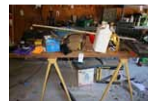
60. Table and Contents