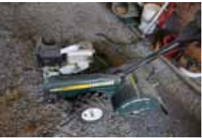
23. Craftsman 6hp Tiller