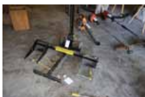
61. Lawn Tractor Jack