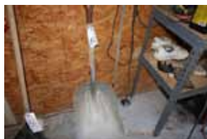
54. Shovel and Rake