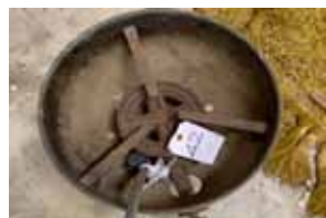
42. Cook Pot