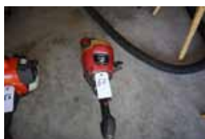
57. Troybilt String Trimmer