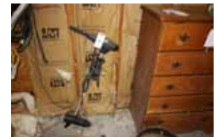
40. Trolling Motor