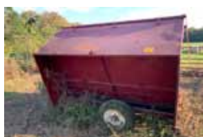
66. American Farmland Portable Feeder

A great selection of household items, furnishings, and farm equipment! Come ready to bid!