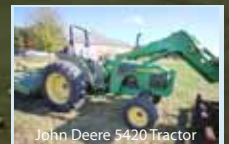
John Deere 5420 Tractor