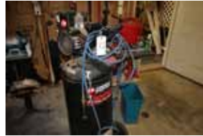
35. Campbell Hausfeld Air Compressor 6.25hp 150psi