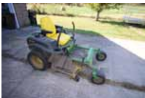
21. JD Zero Turn Mower