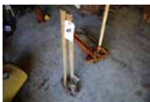
65. Sledge Hammers