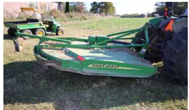
John Deere 8 Foot Rotary Mower

For additional information call 800-222-5003