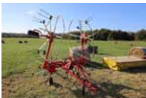
17. Hay Tedder