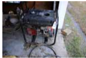
2. 5kw PowerMate Gen