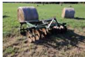
19. 20 x 20 Harrow