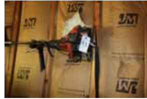
30. String Trimmer w/Attachments