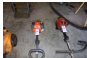
56. Husqvarna String trimmer