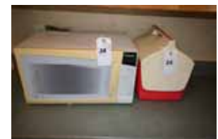
48. Microwave and Cooler

Visit our website at www.auctionsunited.com