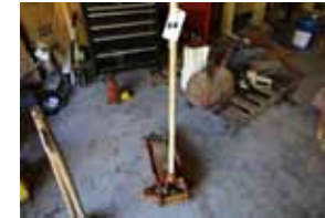
64. Floor Jack