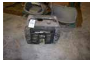
52. Powermate Generator 1850 Watts