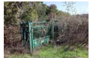
4. Big Valley Chute & Corral