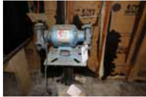
34. Clark 6" Bench Grinder