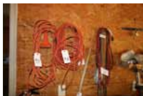
53. Electric cords