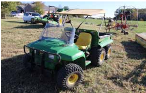
John Deere 6x4 Gator 1499 Hours