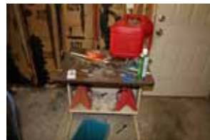
38. Table and Contents