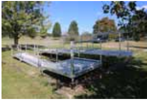
1. Handicap Ramp