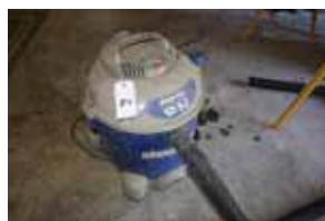
51. Shop Vac