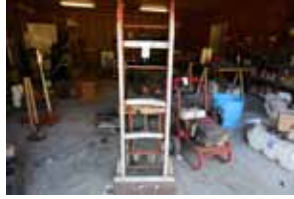
26. Commercial Handtruck