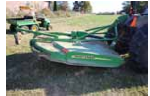
8. John Deere 8ft Rotary Mower