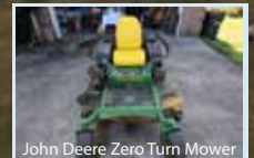
John Deere Zero Turn Mower

Real Estate Terms: A 10% Buyers Premium will be added to the highest bid and will be paid the day of the sale. The balance is due in 30 days after final court approval.