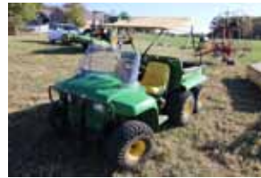
7. John Deere 6x4 Gator 1499 hours