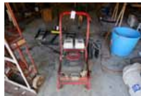
3. Craftsman Pressure Washer 6.75 Hp 2500 psi