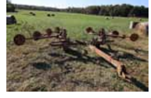
16. Hay Rake