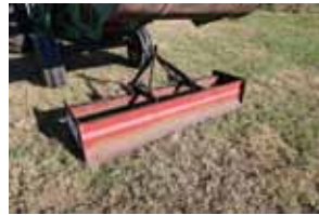
6. Box Blade