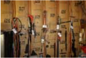
33. Tools on Wall