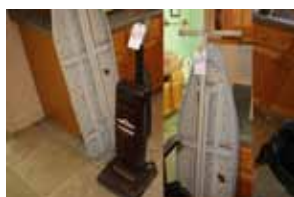
62. Vacuum and Ironing Board