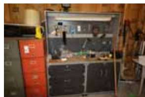
47. Workbench and contents