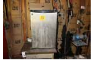
32. Small Refrigerator