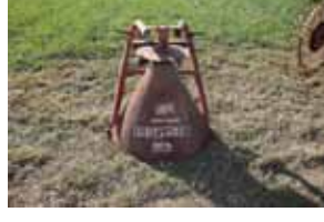
15. Fertilizer Spreader