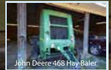
John Deere 468 Hay Baler