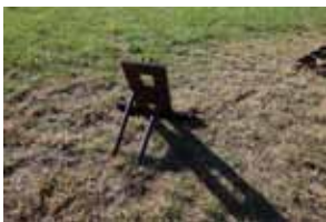
13. Hay Spear