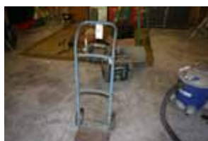
58. Hand Truck