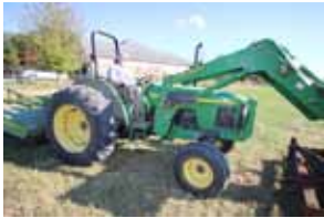
9. JD 5420 Tractor w/Front End Loader 2611 hours