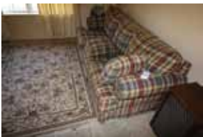
37. Couch and Rug