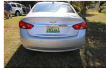
2016 Chevrolet Impala with less than 5,000 miles on the odometer!