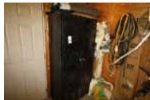
39. Filing Cabinets and contents on top