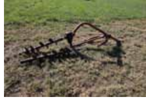
14. Auger (Post Hole Digger)