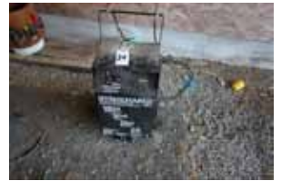
24. 12v Dynacharger

For additional information call 800-222-5003