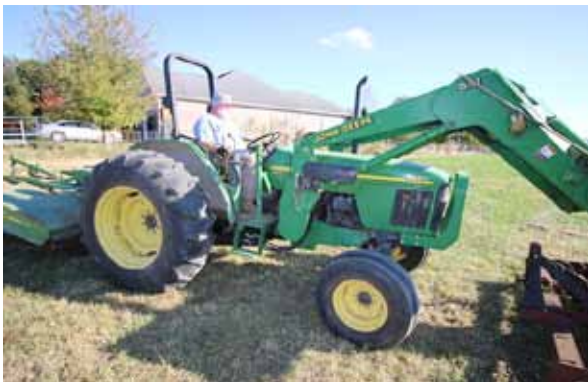
John Deere Model 5420 Tractor with 541 Front End Loader 2611 Hours