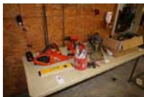
49. Hand Tools & Table