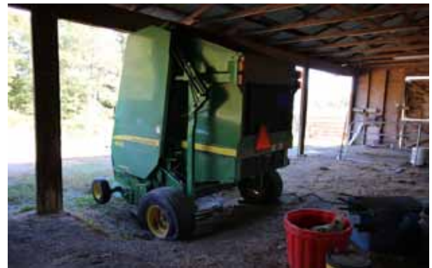
John Deere 468 Megawide Hay Baler