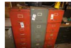
46. 3 Filing Cabinets