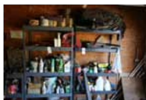
59. Shelves on Wall