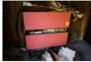
27. Storage Bin