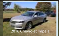
2016 Chevrolet Impala