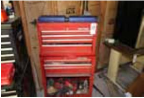
29. Craftsman Toolbox with Tools