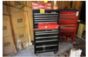
28. Craftsman Tool Box w/Tools