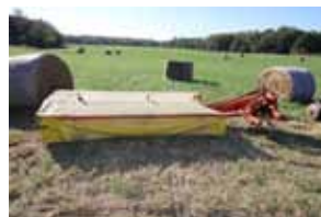
18. Hay Mower