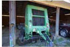
10. JD 468 Megawide Hay Baler