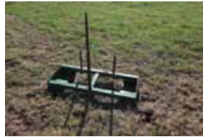
11. Hay Spear