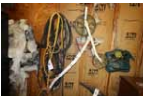
41. Electric cords