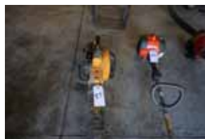
55. Leaf Blower