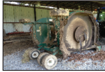
BushWhacker 15 Ft. Batwing Mower