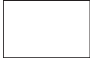
Kubota 271XE Front End Loader 1070, 462 Hrs.