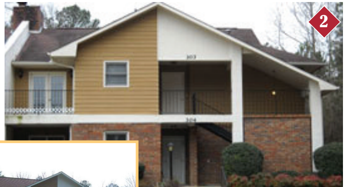
303 Montclair Drive Condo, 2 Bedroom, 2 Baths