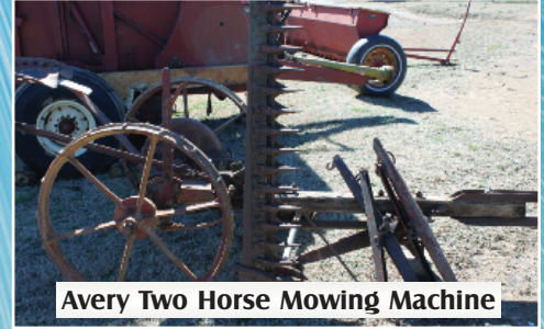
Avery Two Horse Mowing Machine