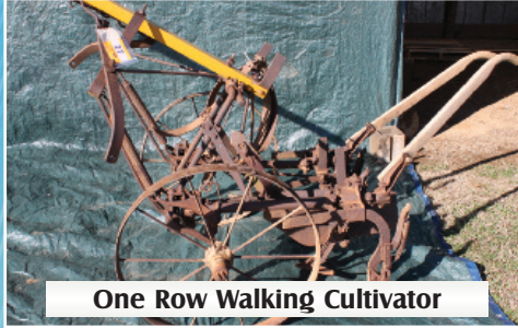
One Row Walking Cultivator