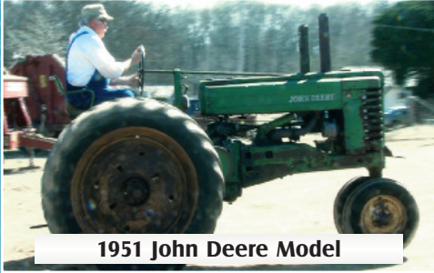
1951 John Deere Model