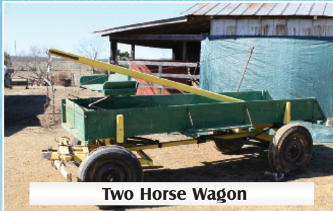
Two Horse Wagon