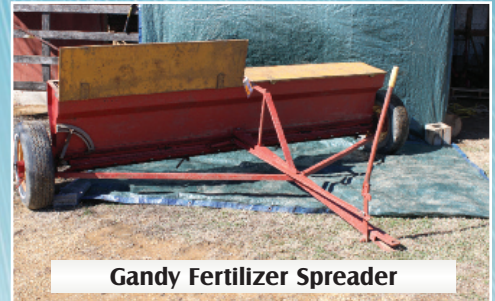
Gandy Fertilizer Spreader