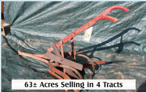
63± Acres Selling in 4 Tracts